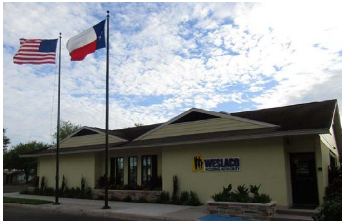
The Authority’s main office in Weslaco, TX

The Weslaco Housing Authority was established in 1950 to serve the residents of Weslaco, TX. The Authority’s mission is to provide safe, decent, and sanitary housing conditions for very low-income families and to manage resources efficiently. It also promotes personal, economic, and social upward mobility to provide families the opportunity to make the transition from subsidized to nonsubsidized housing.