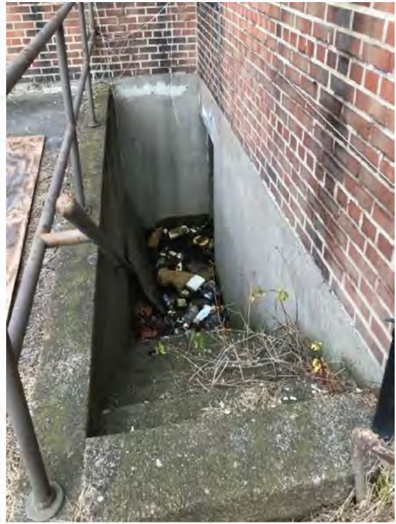
Stairwell filled with standing water and trash