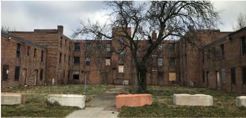
Deteriorated building with open and unsecured windows