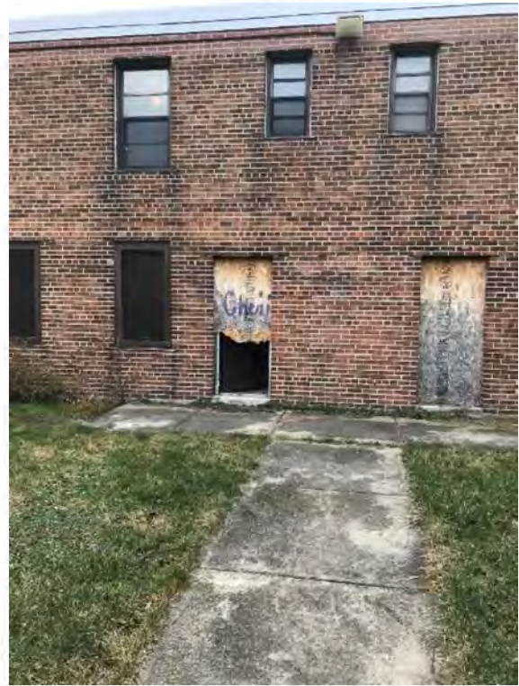
Unsecured door with broken board and graffiti