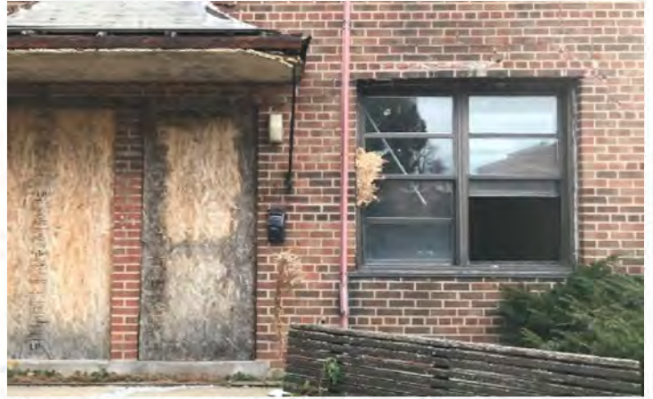
Open and unsecured 1 st floor windows with boarding removed