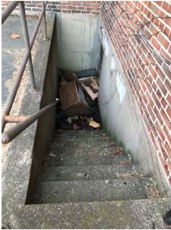
Stairwell filled with trash