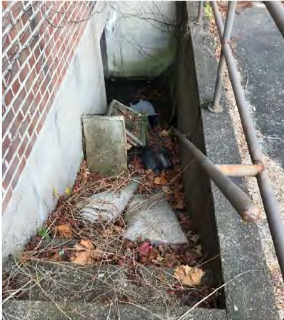
Stairwell filled with water, debris, and electronics

Photos showing outdoor stairwells filled with water, trash, debris, and electronics and the unsafe flooded areas accessible through them