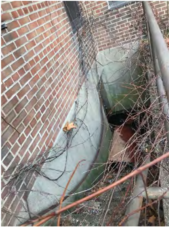
Stairwell filled with standing water and debris