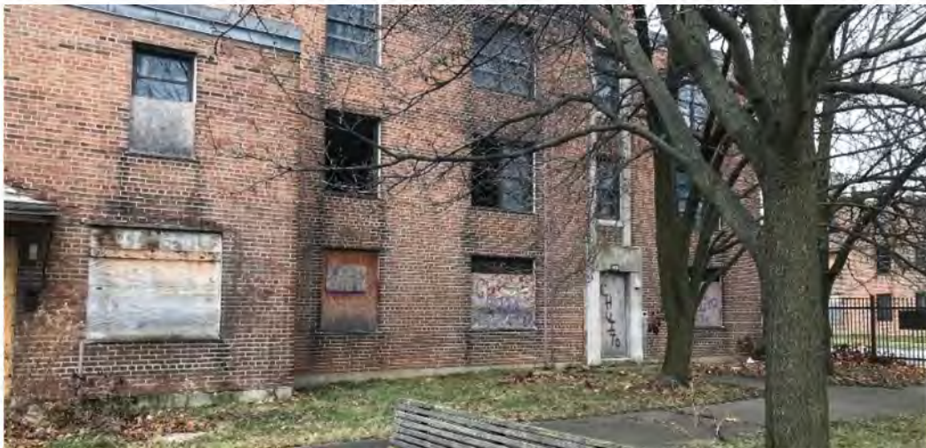
Deteriorated building with open 2 nd floor windows and graffiti on boarded up door