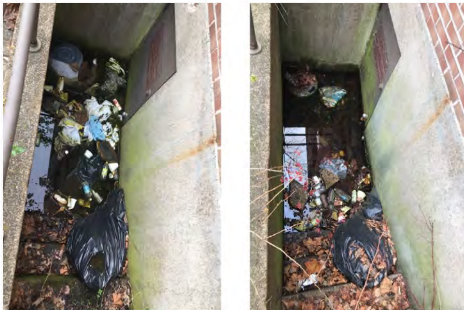
Example of trash and debris present in an accessible stairwell in both May 2019 and December 2020

issues, such as plywood removal or dumping, to keep the Commodore Perry Homes site safe and secure. While the Authority installed concrete barriers and “no trespassing” signs at the development, and stated that it walked or drove through the development daily, replaced or repaired boarded doors and windows as needed, and regularly cleared the site of trash and debris, the issues found during our site visits were widespread. Further, a 2017 physical needs assessment cited flooded stairwells, and photographs taken during our May 2019 and December 2020 site visits showed instances in which accessible stairwells were filled with some of the same trash and debris after nearly 19 months. This evidence showed that the Authority’s process for managing health and safety issues at the development was not sufficient.