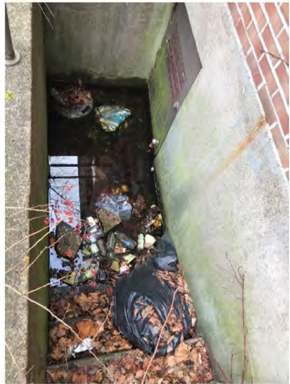
Stairwell filled with water, debris, and trash