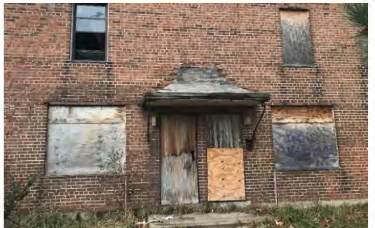
Deteriorated awning and open 2 nd floor window