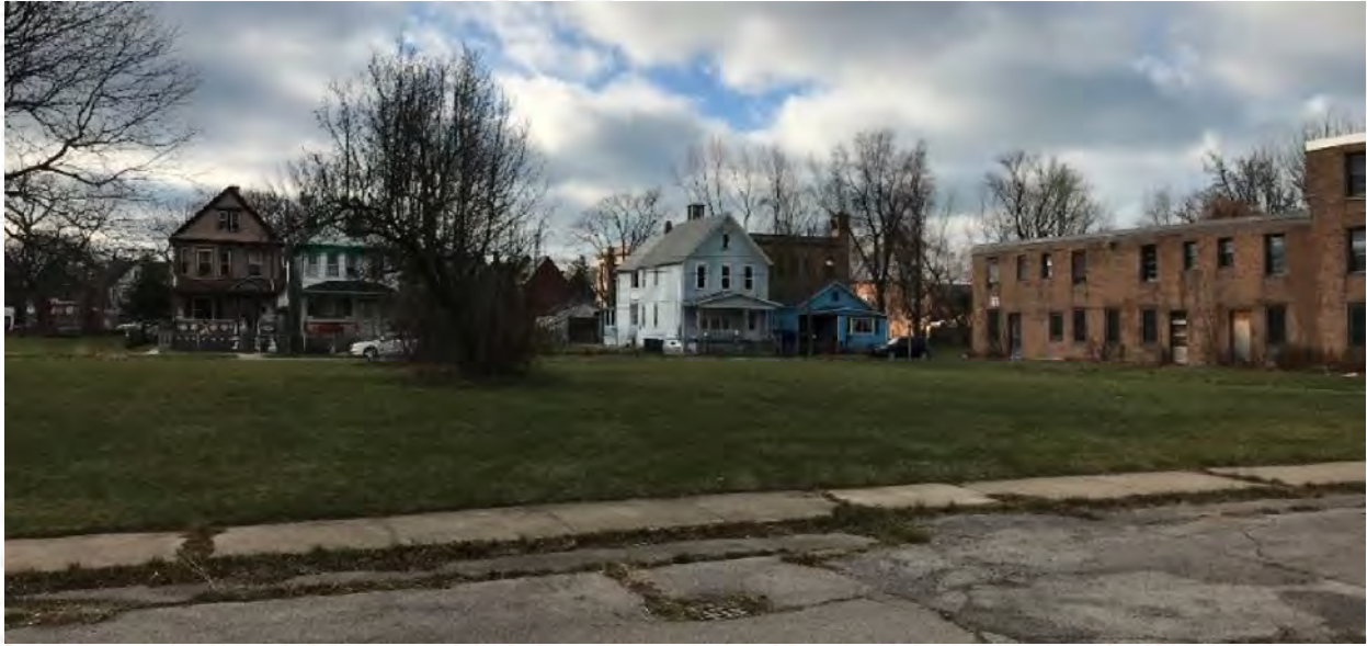
Commodore Perry Homes (right) is near many residential homes, including the homes shown to the left.