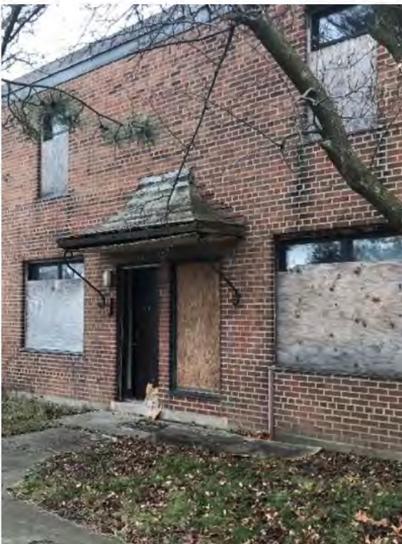
Unsecured door cracked open with board on ground