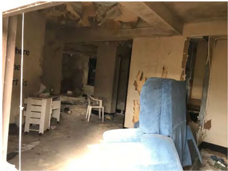
Unsafe space that can be accessed through unsecured 1 st floor window shown in photo to the left. This photo was taken through the window.