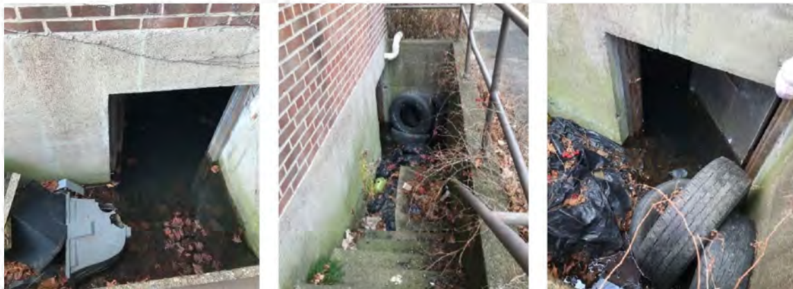
Examples of flooded stairwells with open doors leading into flooded crawlspaces

The health and safety issues noted during the site visits were contrary to various HUD 8 and local requirements. 9 For example, local requirements state that surface and subsurface water must be appropriately drained to protect buildings and prevent the development of stagnant ponds. Further, for unoccupied buildings that have openings, such as windows and doors, through which children, trespassers, or other unauthorized persons may enter the building, such openings must be enclosed with ½-inch or thicker weatherproof plywood or other weatherproof material, which will secure the building to prevent removal by unauthorized persons. In addition, due to the age of the buildings, there were lead and asbestos concerns, including ground contamination.