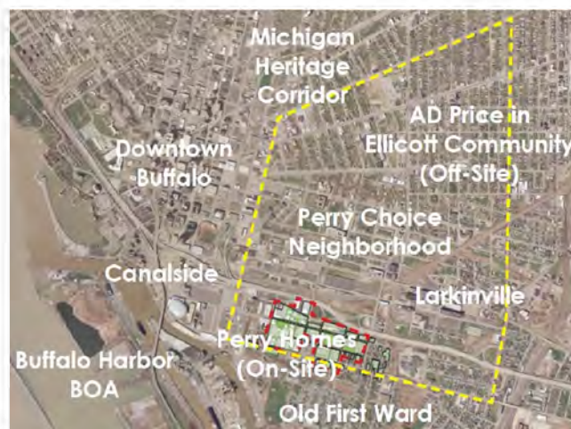
Figure from page 15 of the transformation plan