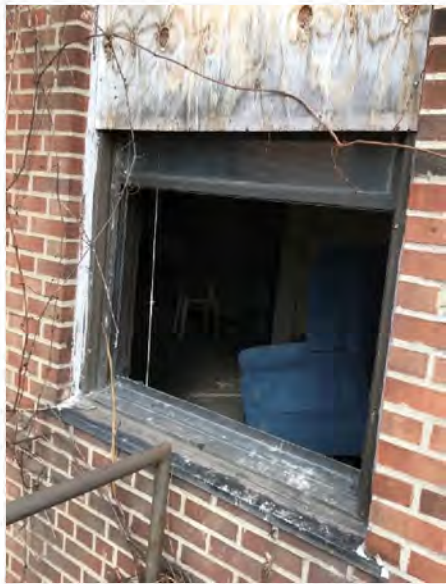
Unsecured 1 st floor window