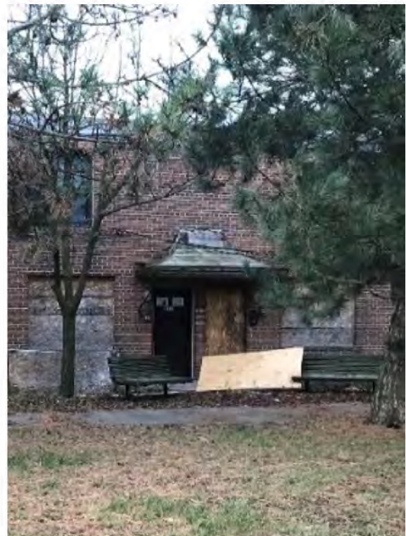
Unsecured door with boarding removed