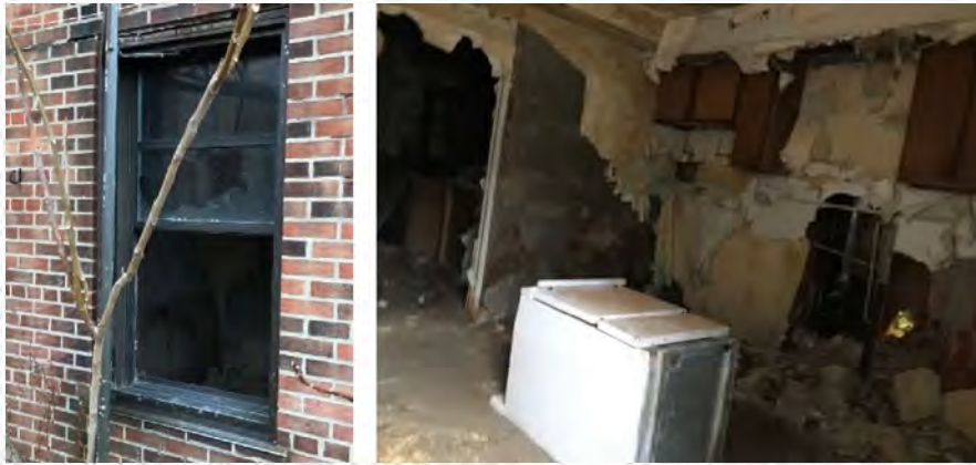
Example of unsecured 1 st floor window (left) and the unsafe space accessible through it (right)