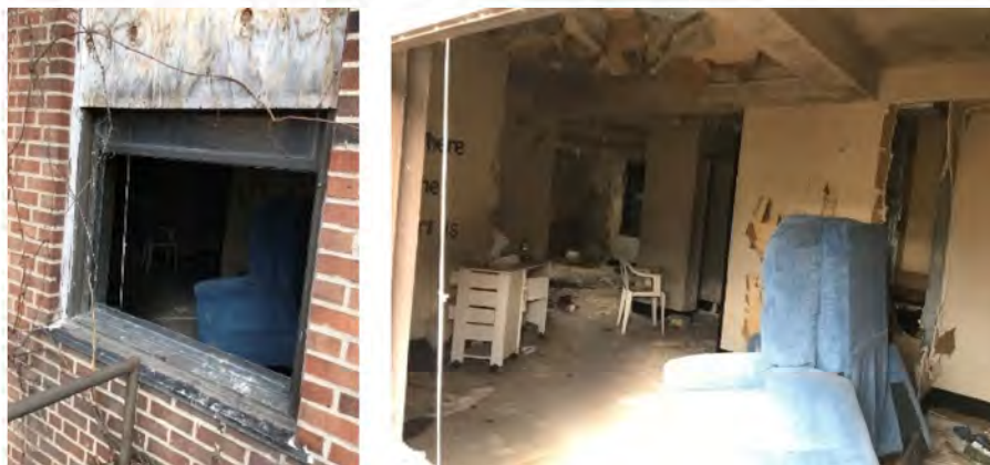
Example of unsecured 1 st floor window (left) and the unsafe space accessible through it (right)

May 2019 and December 2020 visits to the vacant Commodore Perry Homes buildings found widespread health and safety issues, such as unsecured windows and doors, flooded stairwells filled with trash and debris, and accessible crawlspaces. Appendix B contains photographs taken during our December 2020 site visit. Below are examples of the issues identified.