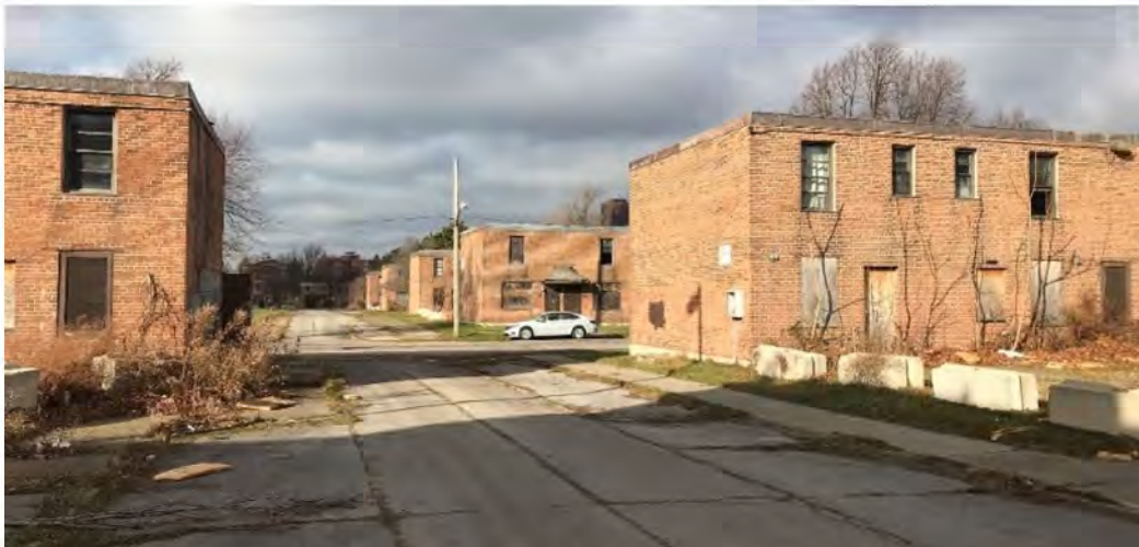
Deteriorated buildings at the development