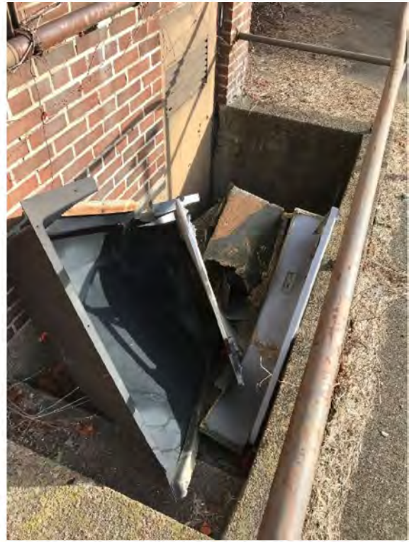
Stairwell filled with trash