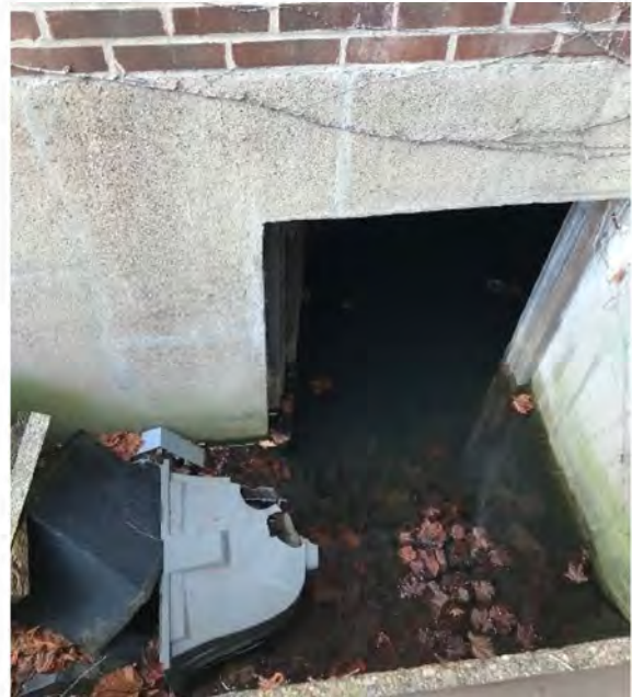
Accessible stairwell doorway from previous photo