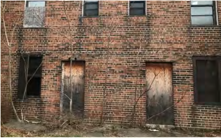
Open and unsecured 1 st floor windows