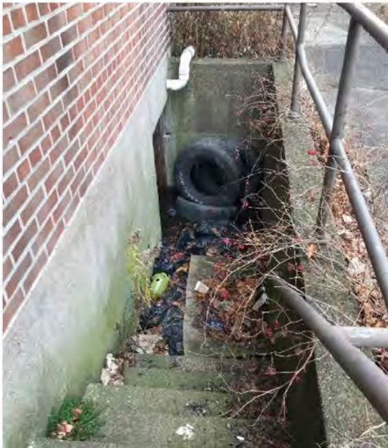
Stairwell filled with standing water and trash