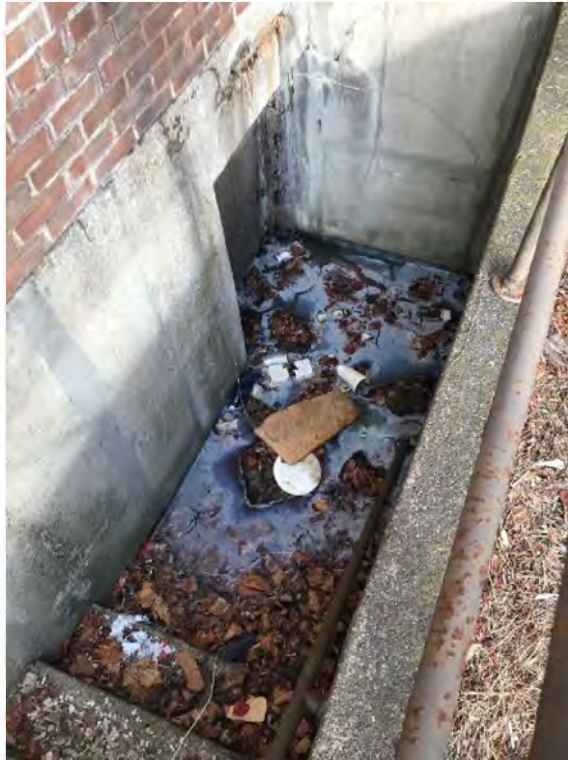
Stairwell filled with standing water and trash