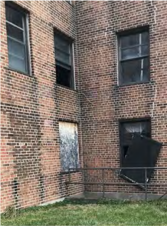
Unsecured 1 st and 2 nd floor windows