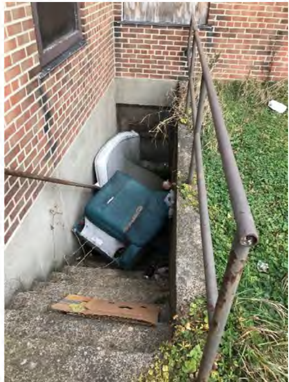
Stairwell filled with trash