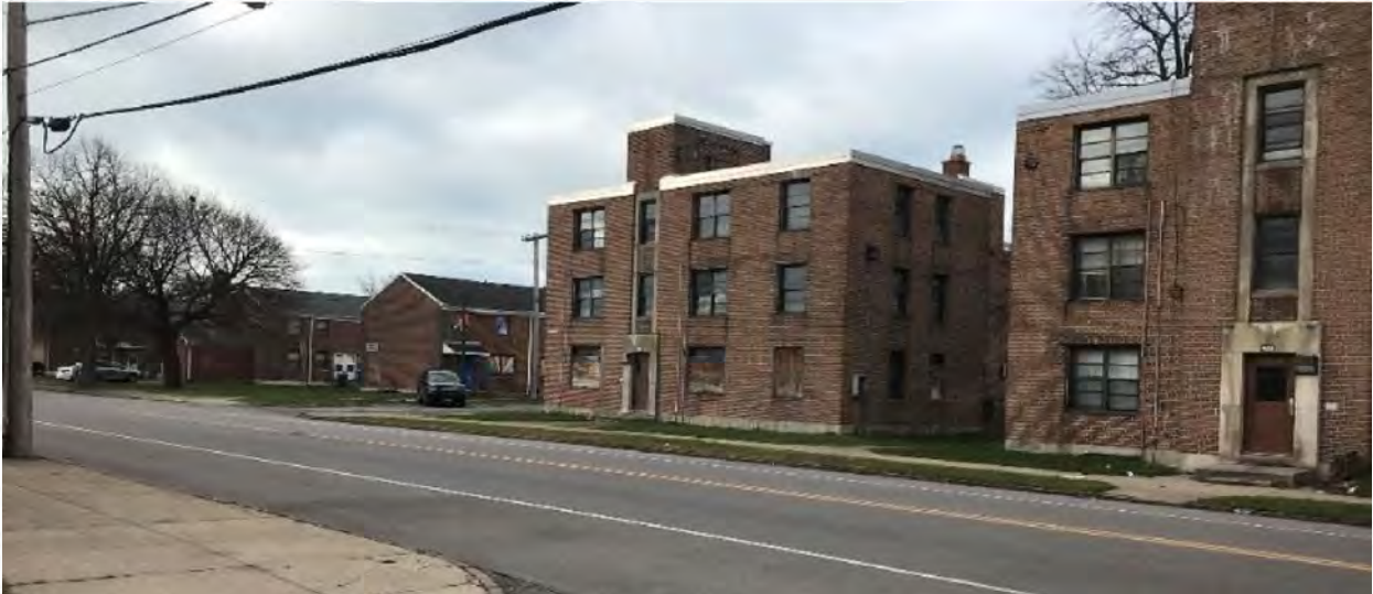
Commodore Perry Homes (right) is near several other Authority developments, including the one shown to the left.