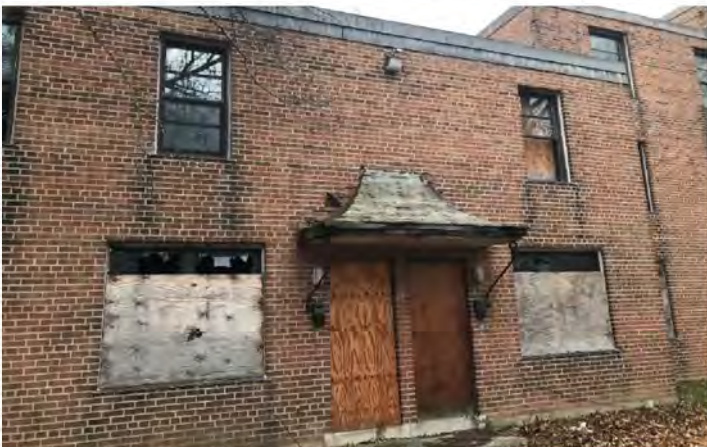
Deteriorated awning and broken glass on 1 st floor window