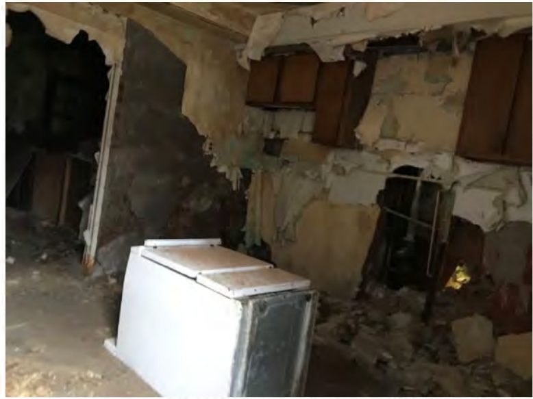
Unsafe space that can be accessed through unsecured 1 st floor window shown in photo to the left. This photo was taken through the window.