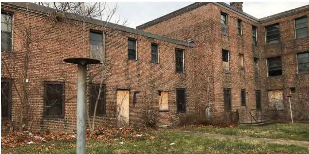
Deteriorated building with boarded windows and unkempt landscaping