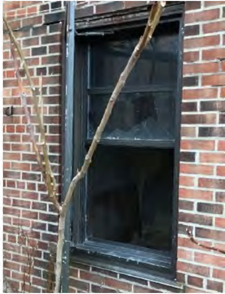
Unsecured 1 st floor window