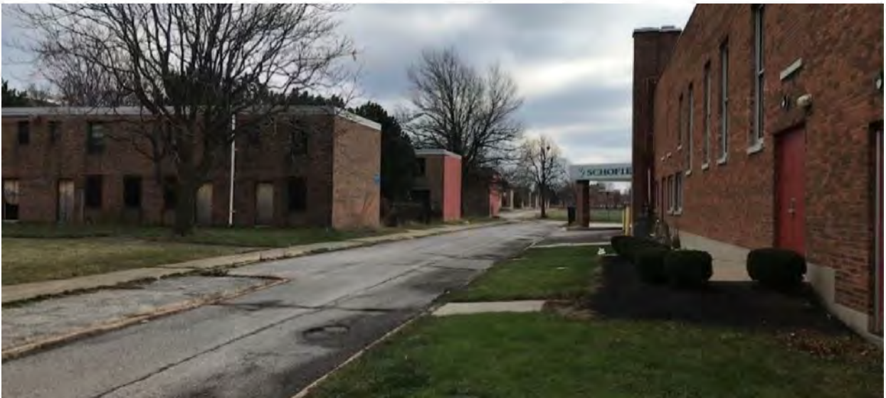
Commodore Perry Homes (left) is across the street from the Schofield Adult Day Health Care Program (right).