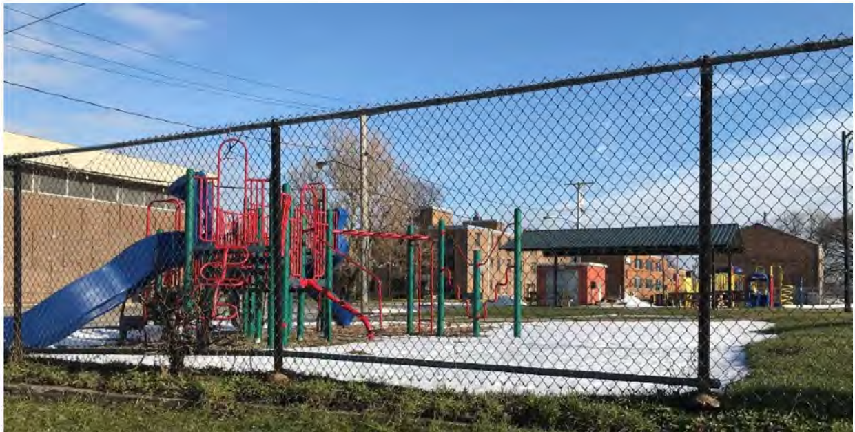
Commodore Perry Homes can be seen in the background of this photo of an Authority playground and splash pad.