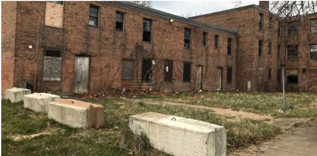
Deteriorated building with open windows on 1 st and 2 nd floors