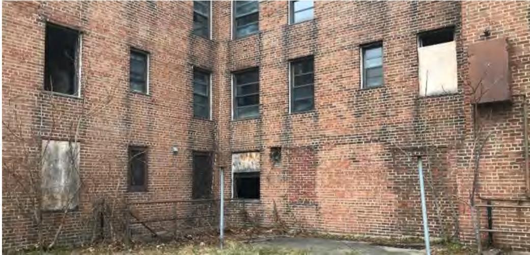
Unsecured 1 st and 2 nd floor windows