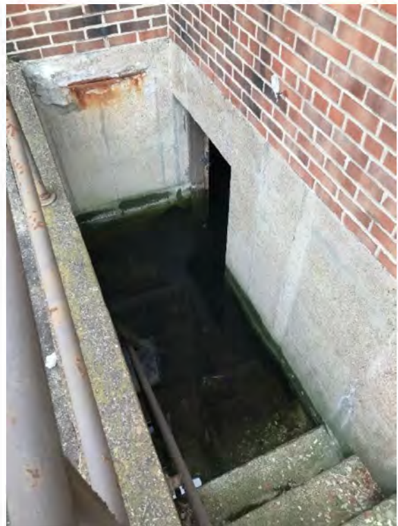
Stairwell flooded and with door open