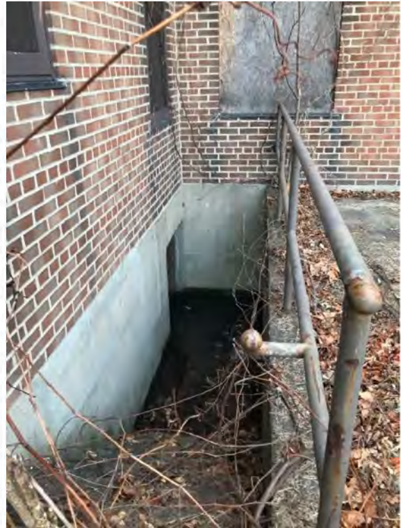
Stairwell filled with standing water