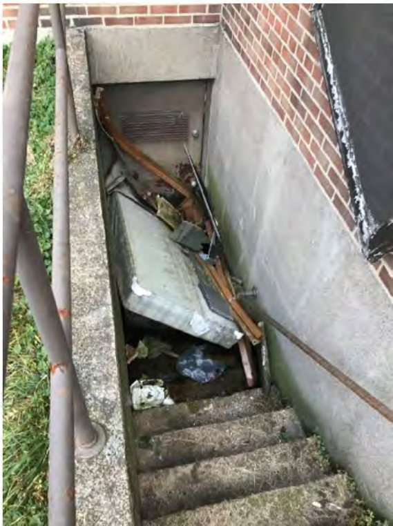
Stairwell filled with trash