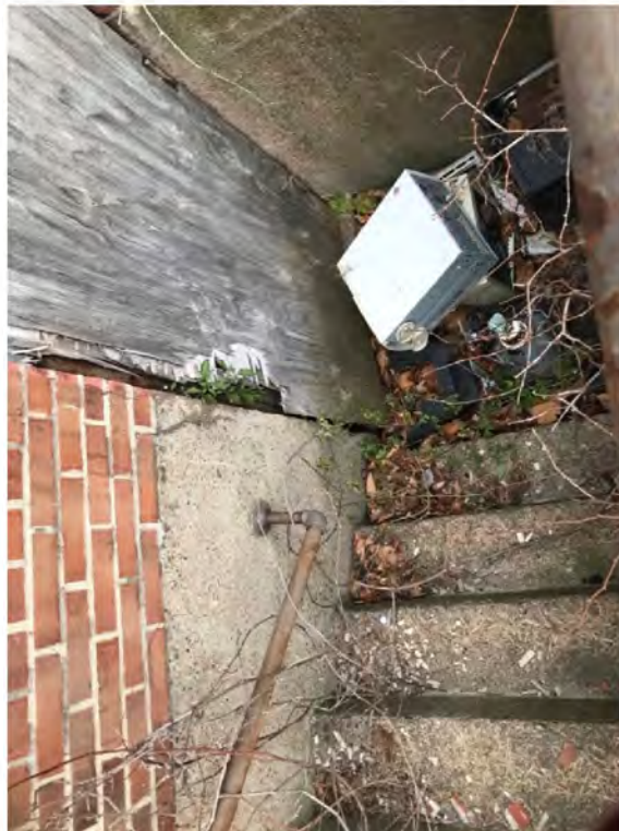
Stairwell filled with trash