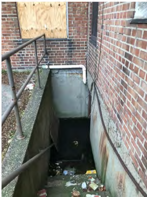
Stairwell filled with standing water and debris