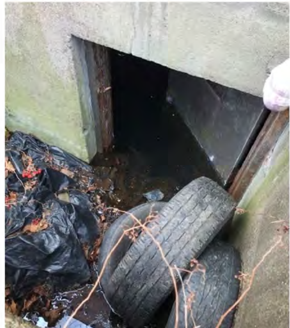
Accessible stairwell doorway from previous photo