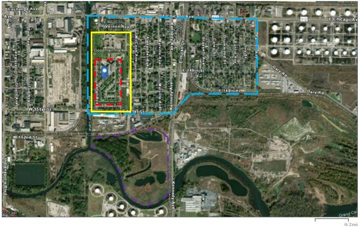
Figure 1 - Map of WCHC and Superfund site