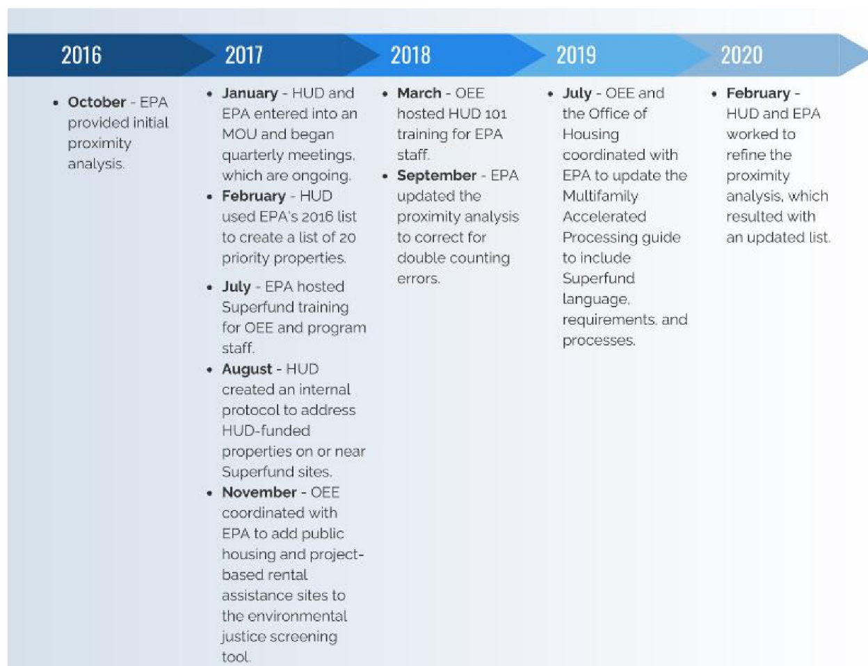
Figure 3 - HUD's collaboration with EPA, October 2016 – February 2020