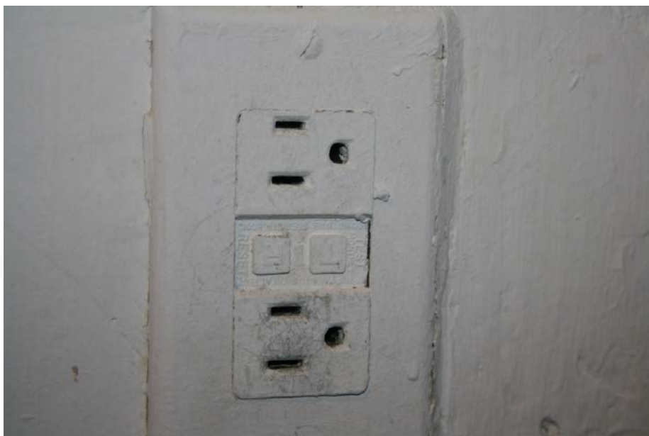
Inspection 2: The ground-fault circuit interrupter in the bathroom did not trip because of paint that had hardened around the test and reset buttons. This condition posed a potential electrical shock hazard that could be fatal if the program participant were to use electrical power near water. HPD did not identify this violation during its July 2018 inspection.