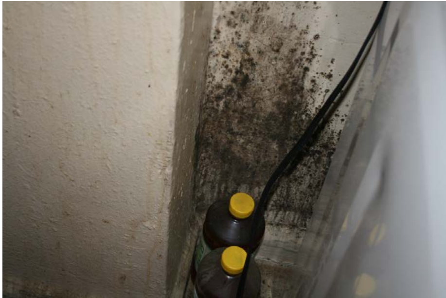
Inspection 5: Mildew on the kitchen wall posed an interior air quality health and safety threat. HPD did not identify this violation during its August 2018 inspection.