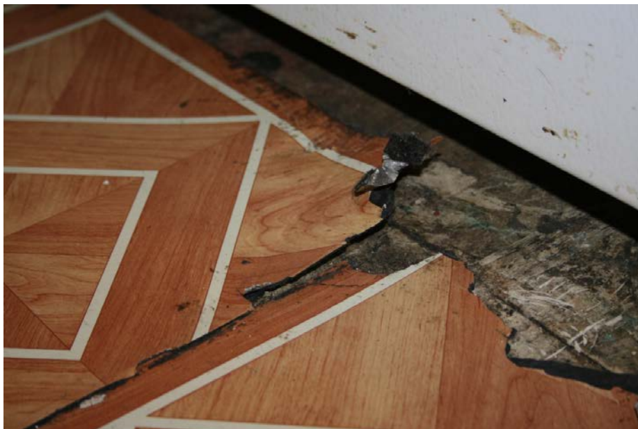
Inspection 6: Cracked vinyl floor tiles in the kitchen posed a potential tripping hazard. HPD did not identify this violation during its August 2018 inspection.