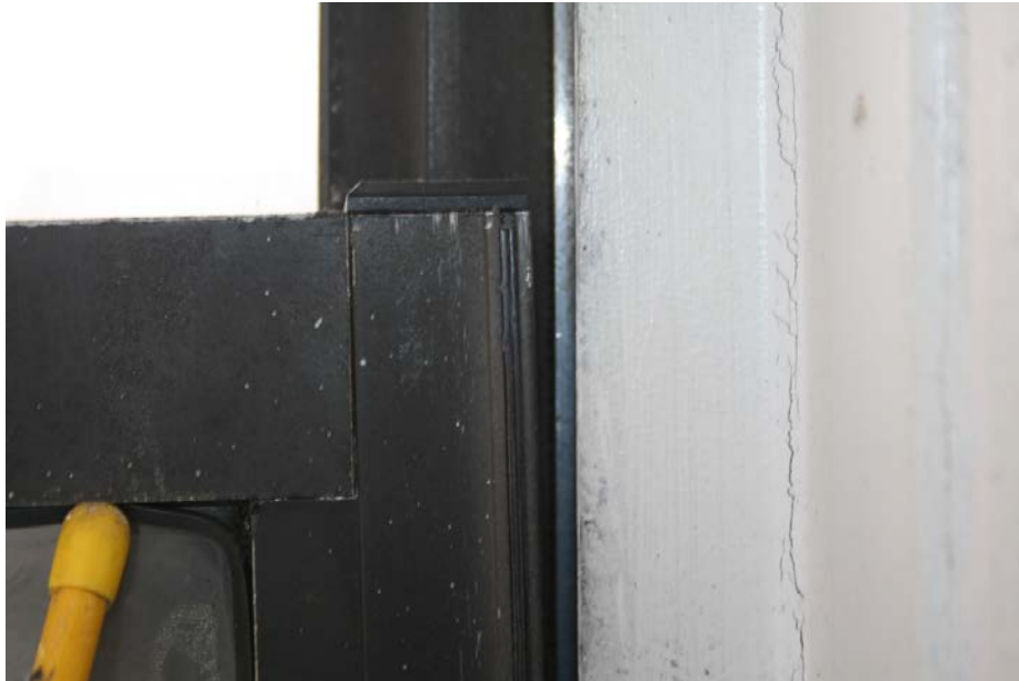
Inspection 3: Windows throughout the unit were drafty, and several were unable to properly open and close. HPD did not identify this violation during its July 2018 inspection.