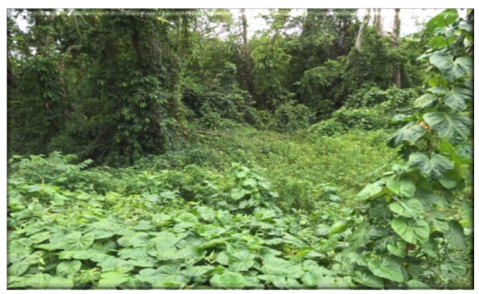
The picture above shows the municipal cemetery project site. The property was acquired in 2000,<sup>2</sup> and the site was abandoned.

More than 7 years had elapsed since the Municipality received the Section 108 funds for the activity, and the intended benefits had not been provided. Based on this condition, HUD had no assurance that the cemetery project would fully meet CDBG program objectives and provide the intended benefits. Therefore more than $1.4 million in Section 108 and CDBG funds disbursed in the project was unsupported.<sup>3</sup>