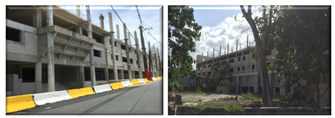
The pictures above show that the multipurpose facility site was abandoned.

More than 7 years had elapsed since the Municipality received the Section 108 funds for the activity, and the intended benefits had not been provided. Based on this condition, HUD had no assurance that the multipurpose facility project would fully meet CDBG program objectives and provide the intended benefits. Therefore more than $8.2 million in Section 108 and CDBG funds disbursed on the project was unsupported.<sup>1</sup>