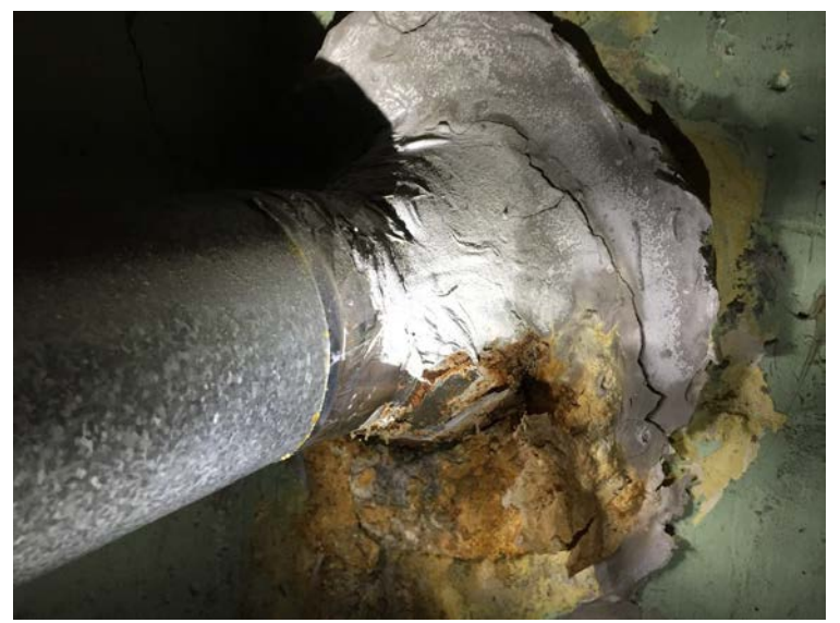
Inspection 49: The boiler flue was corroded next to the chimney and had a hole in it. The Authority did not identify this violation during its November 1, 2016, inspection.