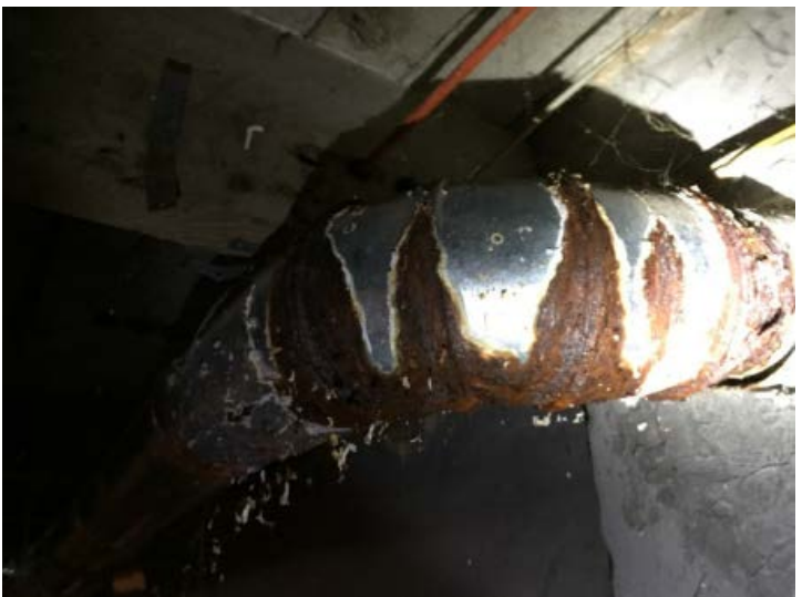
Inspection 60: A corroded furnace flue had holes in it. The Authority did not identify this violation during its November 1, 2016, inspection.