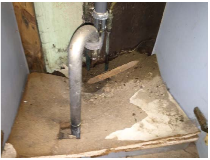
Inspection 51: The floor in the basement bathroom vanity was moisture damaged and collapsed. The Authority did not identify this violation during its November 28, 2016, inspection.