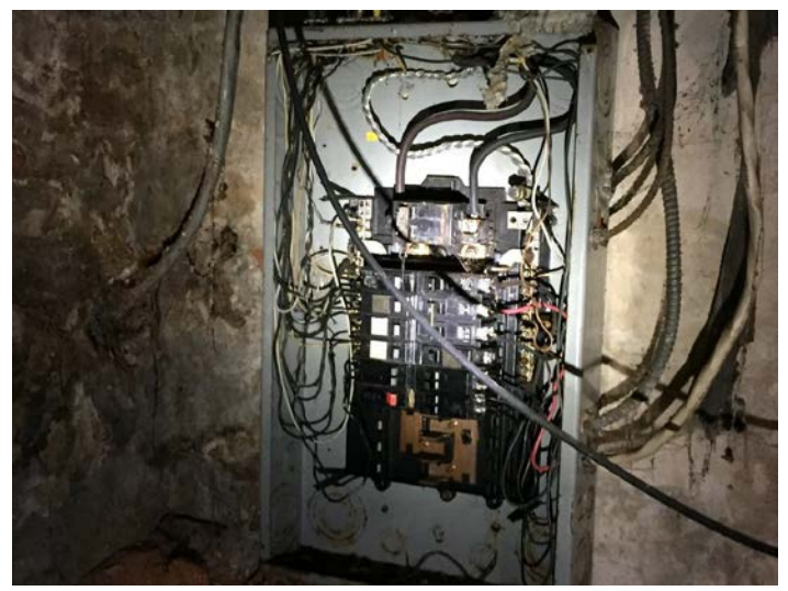
Inspection 32: An unsecured electric panel on a basement wall had no cover on it. The Authority did not identify this violation during its January 17, 2017, inspection.