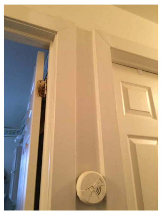
Inspection 38: The smoke detector in the 2<sup>nd</sup> floor hall was installed too low on the wall. The Authority did not identify this violation during its November 14, 2016, inspection.