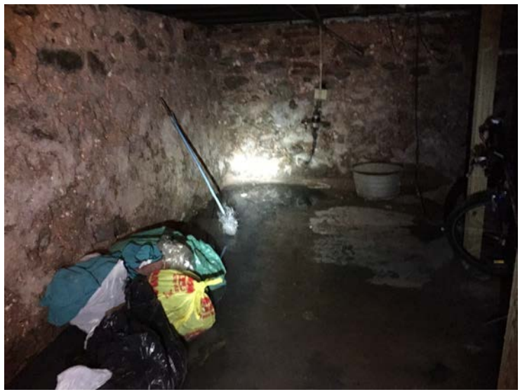
Inspection 11: The foundation walls leaked, leaving puddles and silt on the basement floor. The Authority did not identify this violation during its January 12, 2017, inspection.