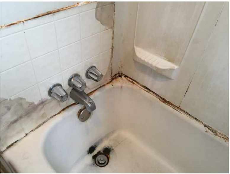
Inspection 25: The caulk joint on the bathtub had possible mold. The Authority did not identify this violation during its December 27, 2016, inspection.