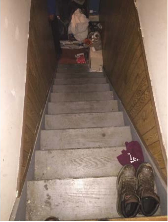
Inspection 5: The handrail in the basement stairway was missing. The Authority did not identify this violation during its November 4, 2016, inspection.