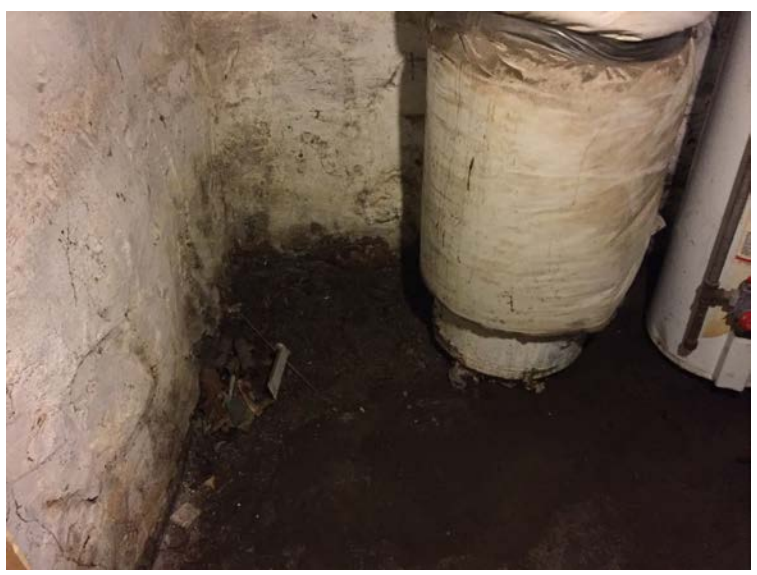
Inspection 4: The mud and puddle were identified in the basement near the water heater. The Authority did not identify this violation during its November 18, 2016, inspection.