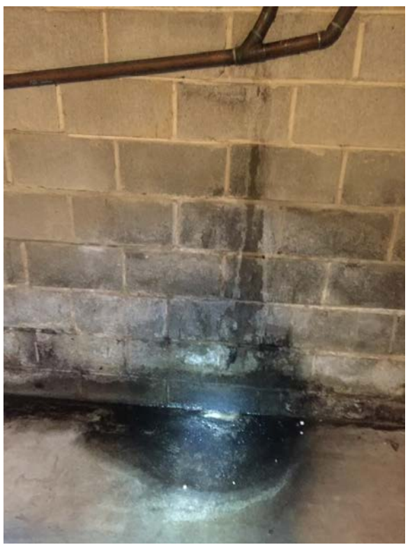
Inspection 34: A drain in the basement leaked on the wall and floor. The Authority did not identify this violation during its January 18, 2017, inspection.