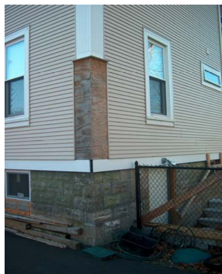
25 Pine Street - unfinished corner boards and cleanup

In another example, the City approved final retainage payments for two CDBG-funded housing rehabilitation contracts based on final inspections that reported deficiencies. These deficiencies included a lack of adequate fire blocking in the furnace closets and the units' walls and ceilings. On another project, the City released retainage payments on a HOME-funded rehabilitation contract to an owner without ensuring that unfinished items (punch list items) were completed. Our physical inspections as of November 7, 2006, showed that some of these items were not corrected although the City made the final payment of retainage in December 2004 (see pictures below).