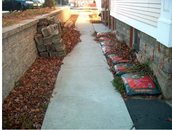
25 Pine Street - unfinished landscaping and cleanup