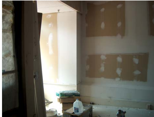
830 Chicopee Street - unfinished commercial space

were provided through a contract modification, the City still did not ensure that the commercial space was completed. An August 1, 2006, Office of Inspector General (OIG) inspection of the property showed that the commercial space was still unfinished (see picture below).